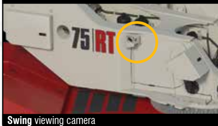
Swing viewing camera