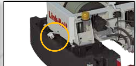
Rear viewing camera