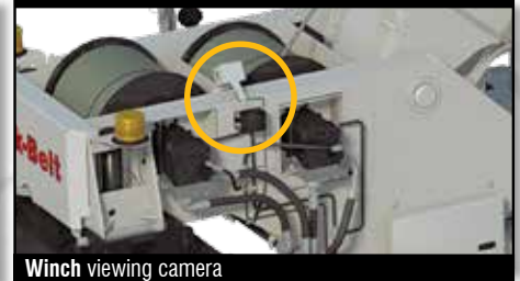
Winch viewing camera