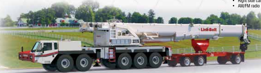
Boom dolly/trailer ready