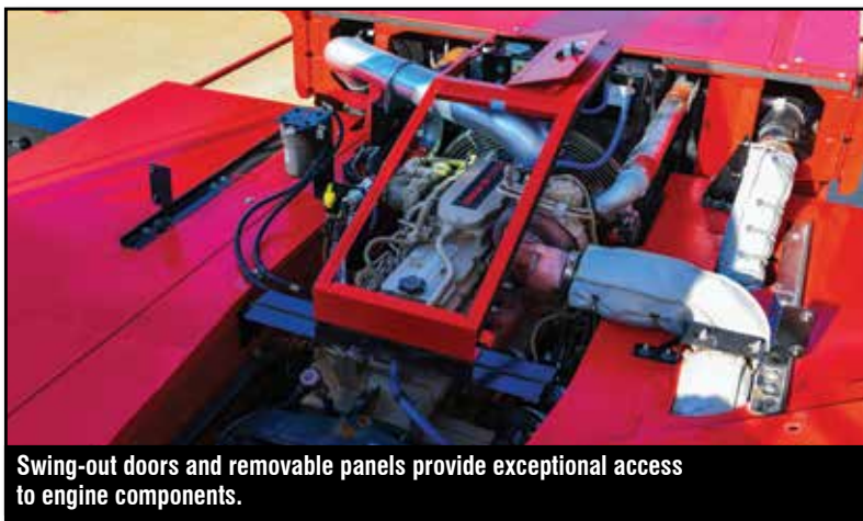
Swing-out doors and removable panels provide exceptional access to engine components.