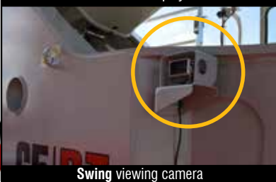
Swing viewing camera