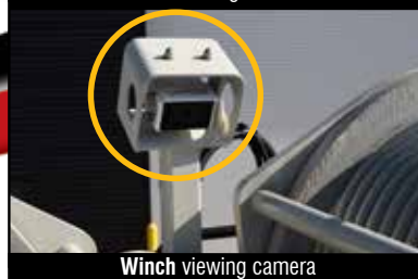
Winch viewing camera