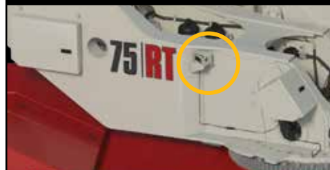
Swing viewing camera